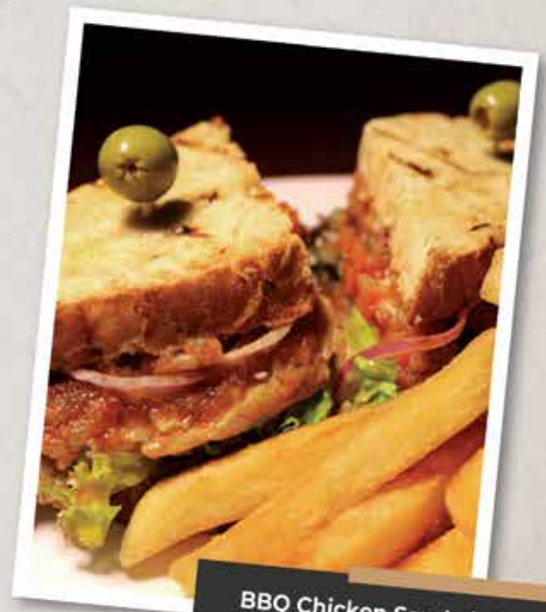
BBQ Chicken Sandwich