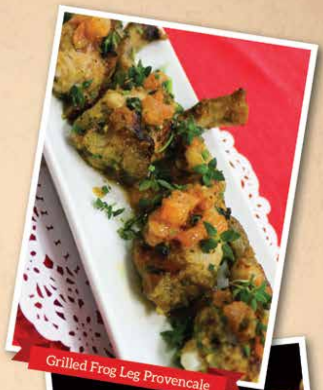
Grilled Frog Leg Provencale

French Fries ..... with Black Pepper Gravy