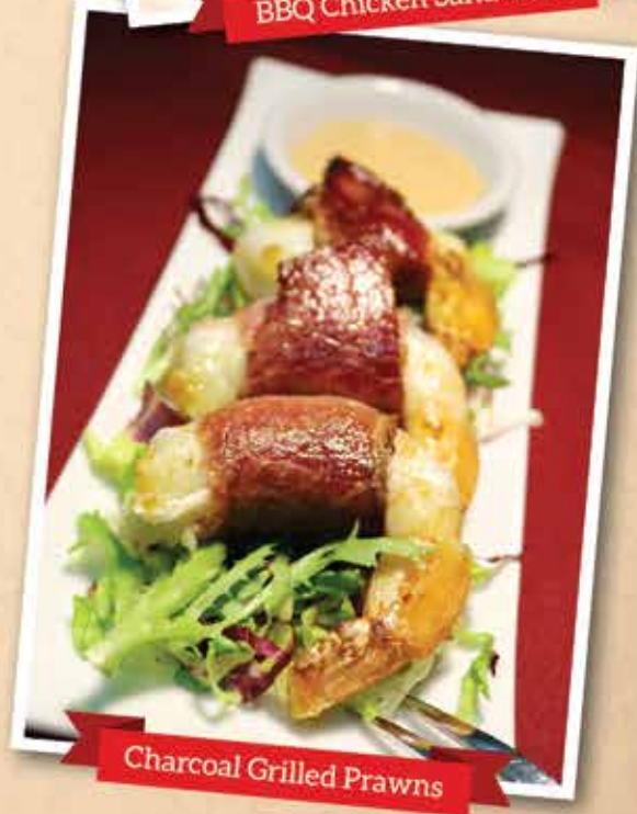
Charcoal Grilled Prawns